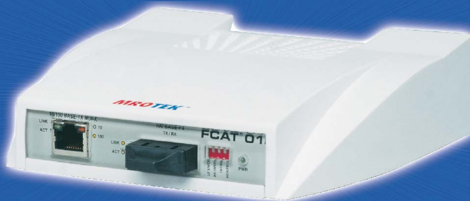
FCAT ® 01

The FCAT ® 01 series of Fast Ethernet Media converters provides media conversion from 10/100BASE-T to 100BASE-FX on multimode or single mode fiber ranging from 2km to 100kms. Available in Managed, Unmanaged, Stand Alone/Rack, AC/DC Power supplies & a versatile range of Fiber Optic interfaces FCAT ® 01 series becomes a complete offering to suit Carriers, Service Providers & Enterprises for wide range of deployments.